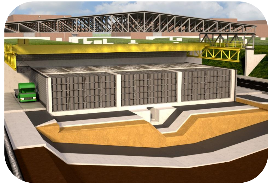
NEW RADIOACTIVE WASTE REPOSITORY